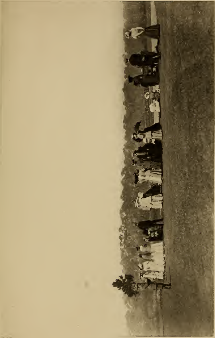
NEW GOLF COURSE